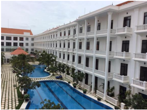
View of the main building from back side